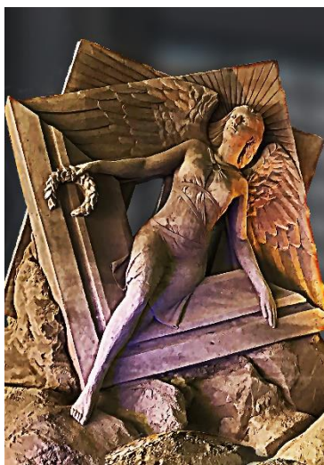
2018 Winner – Tom Koet, USA “Victory”